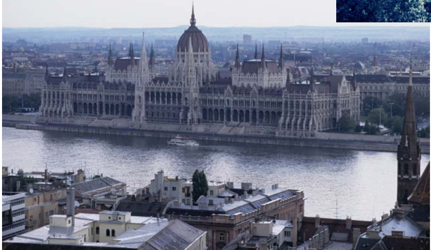
Houses of Parliament – Budapest